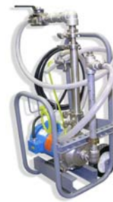
Portable Test Unit

Small-Scale Rental Units Available for Performance Evaluation!