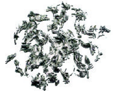
Using CHIPS AWAY