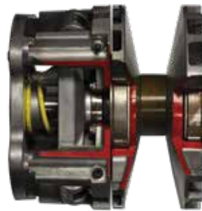
CVT (side view)