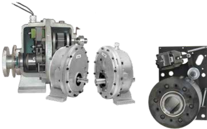
Intermittent Motion Clutches