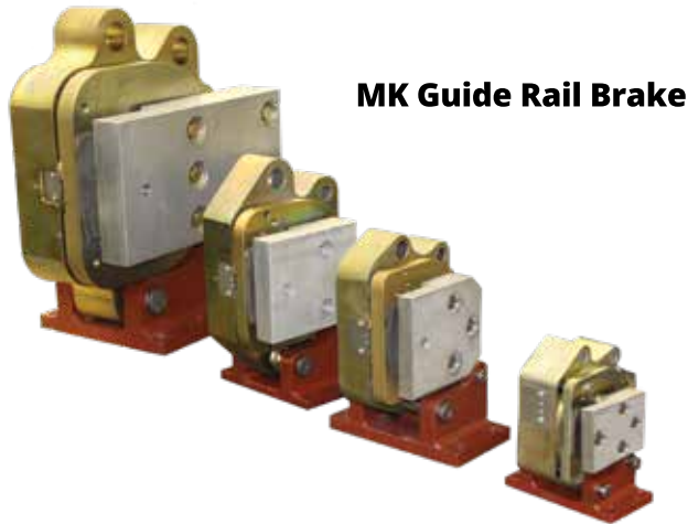
MK Guide Rail Brake

The patented Hilliard MK Guide Rail Brake is designed for use on elevators, conveyors, cranes, or other devices requiring a spring-applied, electromagnetically released brake. The patented MK brake can be applied to a guide rail or a brake disc.