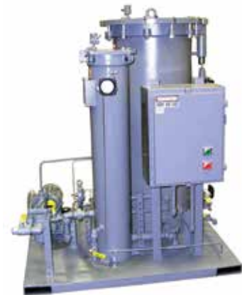
Hilco® Oil Reclaimer