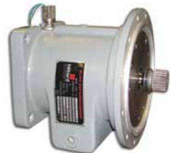
Hilliard Engine Starter

Hilliard manufactures a wide array of starters for gas turbines and reciprocating engines. Our engineers stand ready to customize an engine starter to your specifications. However, one of our standard configurations may fit your needs without modification.