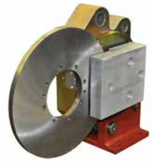
MK Disc Brake

Hilliard has developed a line of power units capable of controlling braking systems for a multitude of scenarios and applications. Hilliard's power units are designed and assembled in Elmira, N.Y. with only top quality components to ensure the integrity and longevity of each braking system.