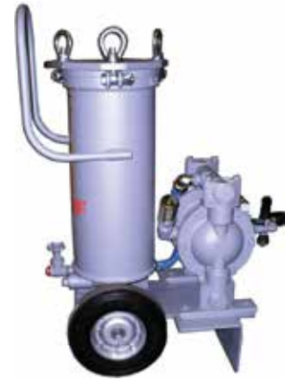
Hilco® Portable Filter